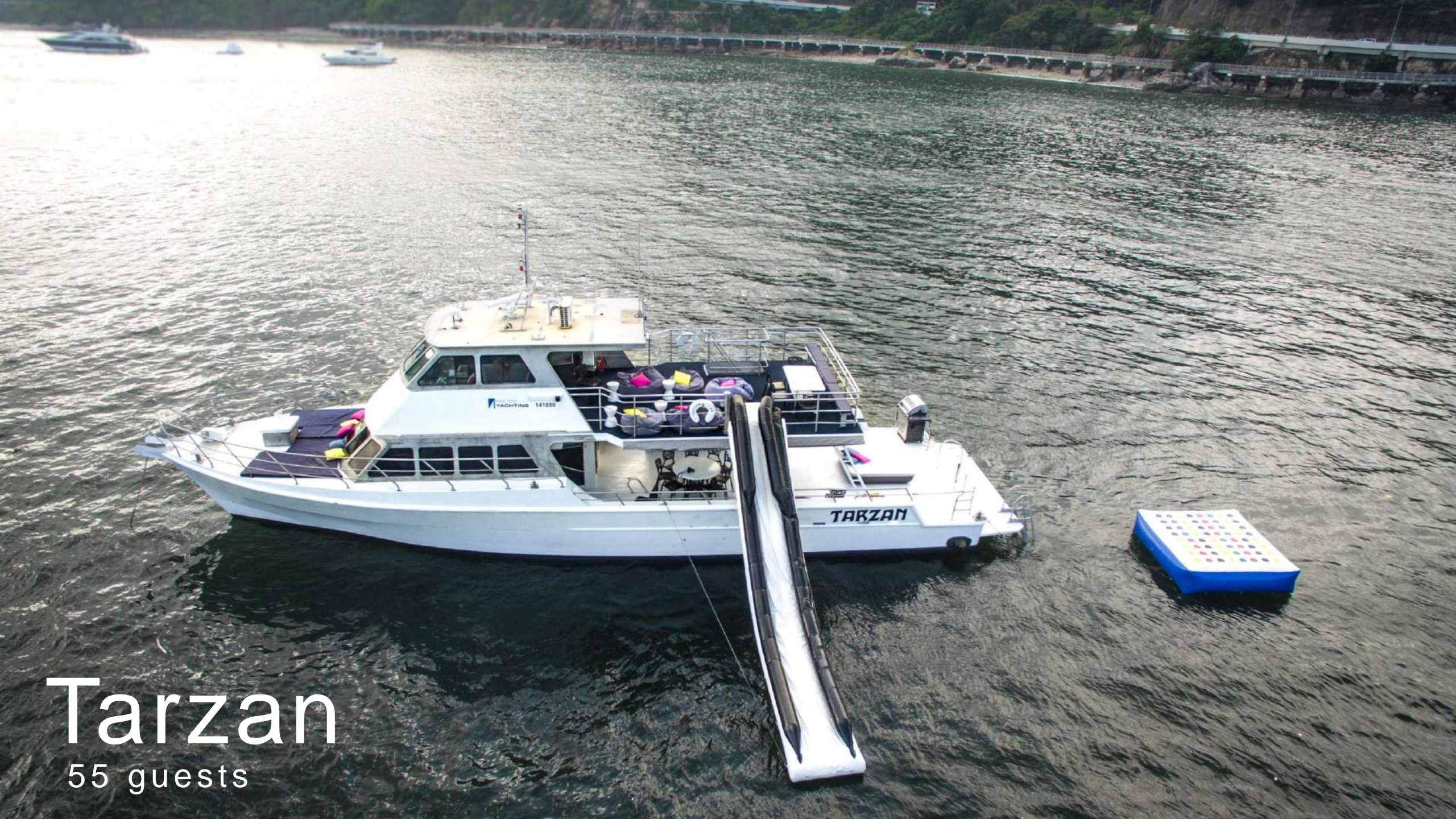
Tarzan 55 guests